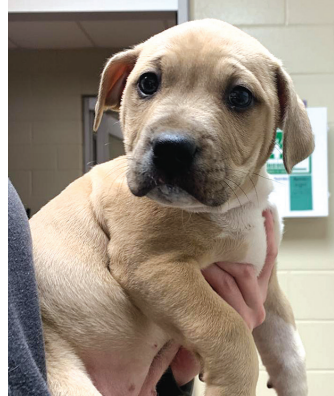
Limp Biscuit at intake

Thanks to our amazing foster program, Limp Biscuit received the best care and love any puppy could ask for. Limp Biscuit's leg completely healed and she is now living her best life, running, jumping, and soaking up the love. For more information on how you can make a difference in the lives of our animals as a foster parent, visit pawshumane.org/foster .