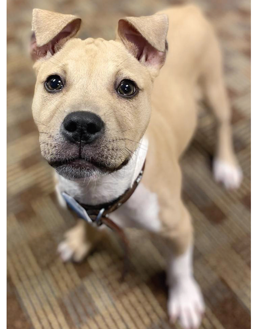
Limp Biscuit at 4 months old